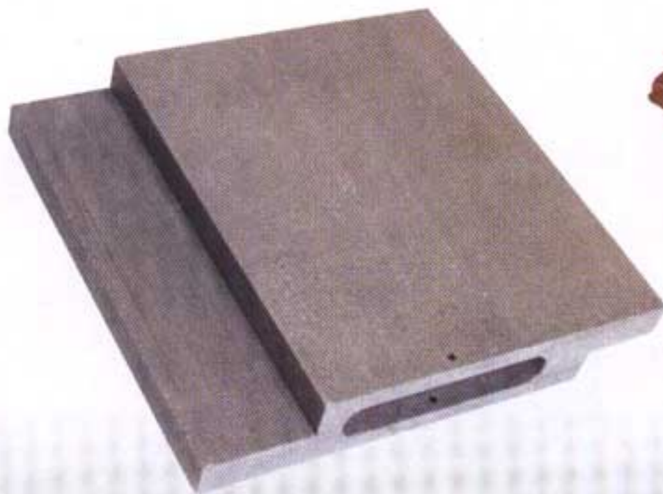
Graphite Outlet Seal For Cement Industries