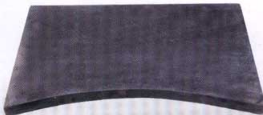
Graphite Supporting Block For Cement Industries