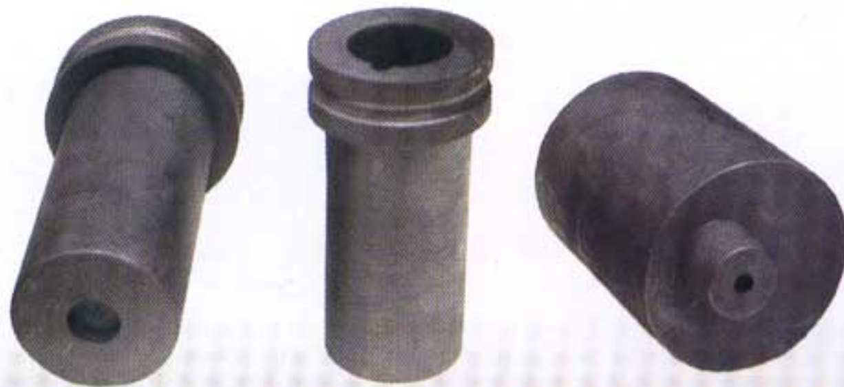
Graphite Crucible For Jewellery Industries

Carbon 'V' block of high quality is used in Diamond Manufacturing Unit. This Carbon 'V' block is use in the machines of diamond industries like sowing machine & grooving machine to support the spindle at two ends. Where the diamonds are cut and given different shapes.