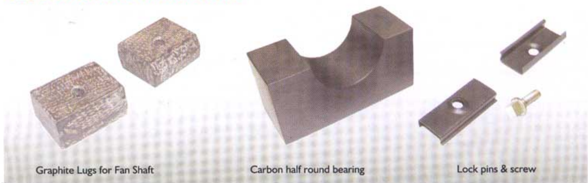
Graphite Lugs for Fan Shaft