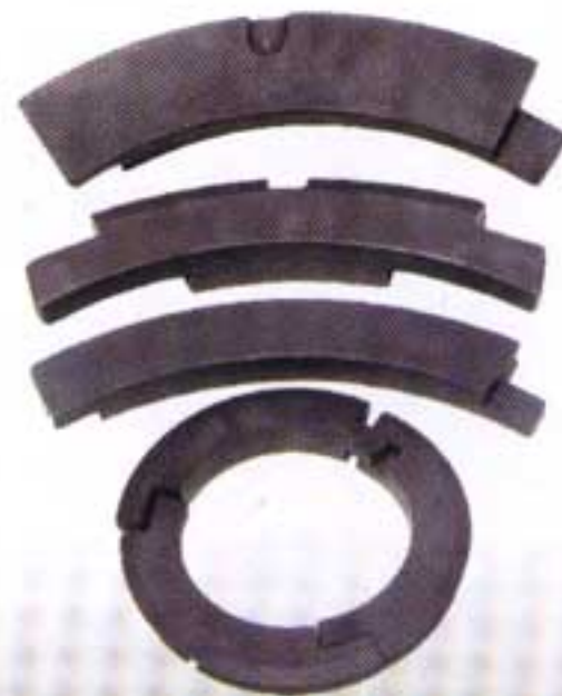
For Electricity Board & Dam Project