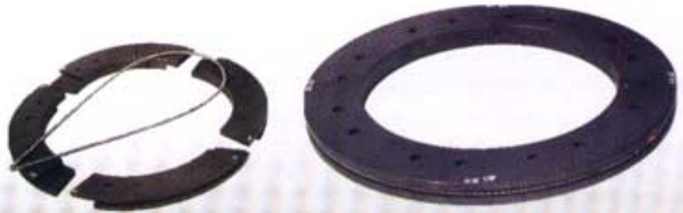
For Cement Industries