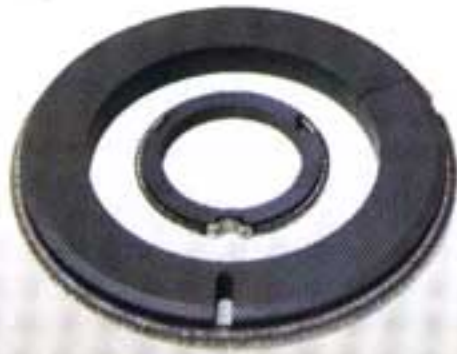
For Sugar Mills & Fertilizers Industries

Carbon Gland rings provides an economical simple and effective seal on impulse turbines, water turbines, steam turbines, gas turbines, low pressure fans and blowers.